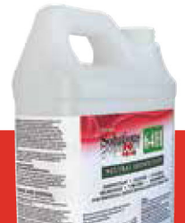
ES64H Neutral Disinfectant Cleaner

Sizes: ES72-IS (0.52 US Gal.) ES72-4 (1 US Gal.) ES72-CS (1.25 US Gal.)