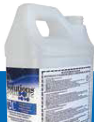
ES72 Hydrogen Peroxide Multi-Purpose Cleaner

In a perfect world, one dilution of a single chemical would clean everything and sanitize while you're cleaning... unfortunately, it isn't a perfect world. The over-use of disinfectants and sanitizers has been connected with both the development of "Superbugs", and the increase of asthma and other breathing difficulties. Disinfectants should be used carefully, sparingly and thoughtfully.